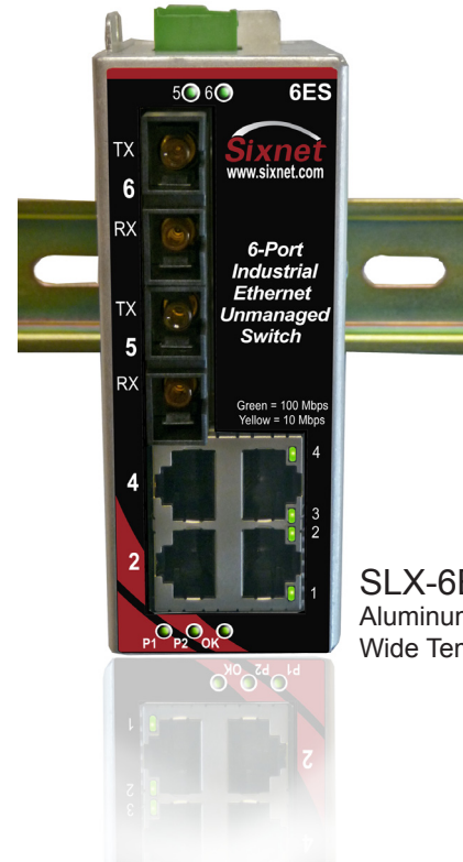
SLX-6ES-4/5 Aluminum Case Wide Temperature

We have been designing industrial hardware such as Remote Terminal Units for over 30+ years and have used this expertise to design the toughest Ethernet switches on the market. Don't trust your critical communications to so-called industrial hardware from commercial switch manufacturers. Sixnet switches give you proven assurance that your system will keep running for years to come.