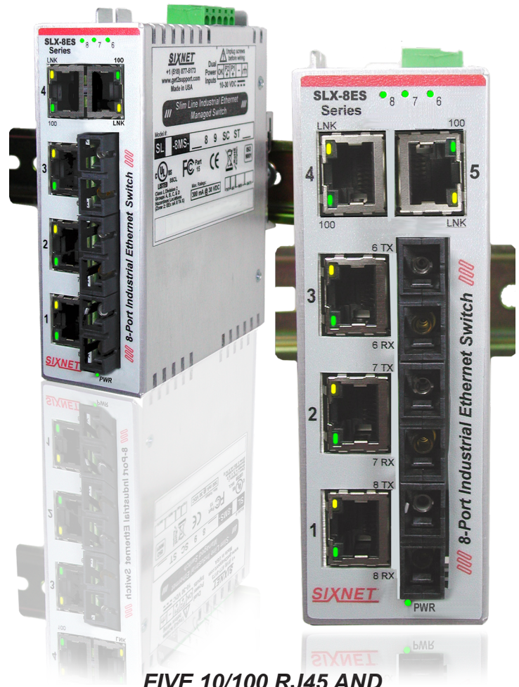
FIVE 10/100 RJ45 AND THREE FAST ETHERNET FIBER OPTIC PORTS